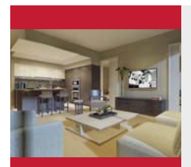
Artist rendering of The Harmon interior

Have questions about the green features of CityCenter? Contact a member of the Broker Team at 866.520.2489 or <a href="mailto:Brokersales@citycenterresidential.com">Brokersales@citycenterresidential.com</a> and they will be delighted to answer any questions you might have.