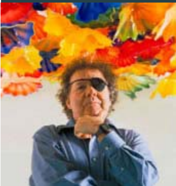
Dale Chihuly and his exquisite glass display.