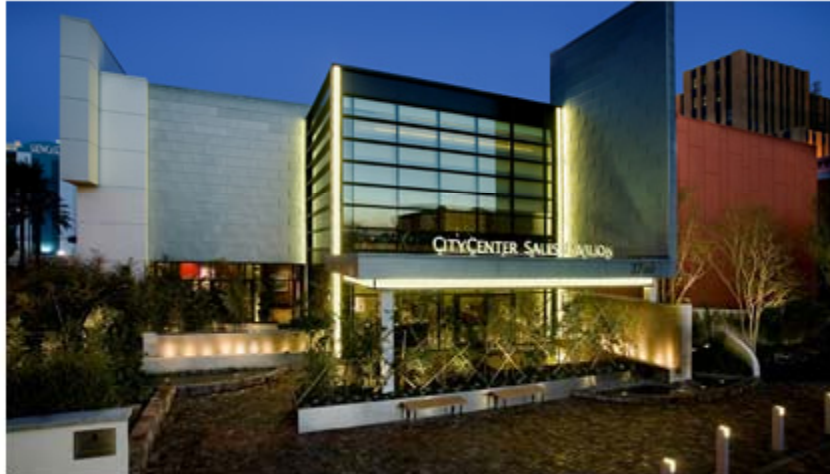
CityCenter Residential Sales Pavilion