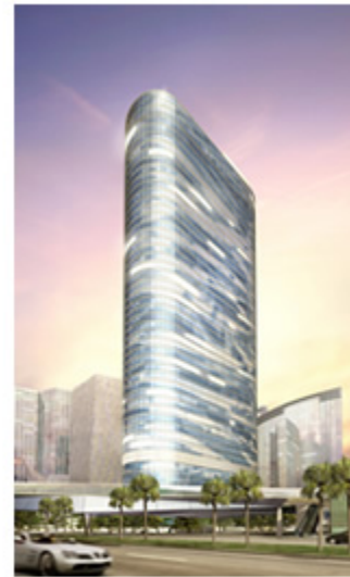
The Harmon Hotel, Spa & Residences

With construction underway, three of the four residential developments selling going straight to contract, and the fourth residential development, The Harmon Hotel, Spa and Residences, slated to launch September 17, 2007, we are focusing on expanding our sales reach. We have opened sales offices in Beverly Hills and Hong Kong and over the past several months have participated in many high-profile events, including MIPIM Cannes and the Condé Nast Traveler Top 100 in New York City, all designed to increase awareness of the unique residential offerings at CityCenter.